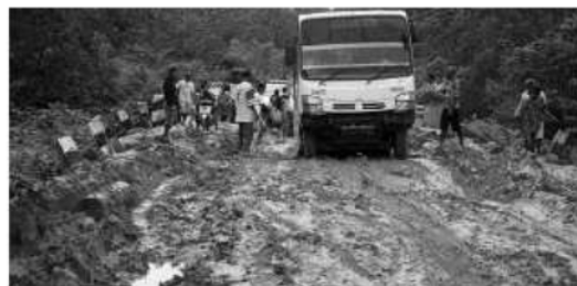
Figure 2. Example of Road Conditions in Papua

From the events that developed as above, led to several contracts that late settlement and even a failure of construction. So in this study will identify the risk assessment on the performance of time on the development of road infrastructure in Papua.