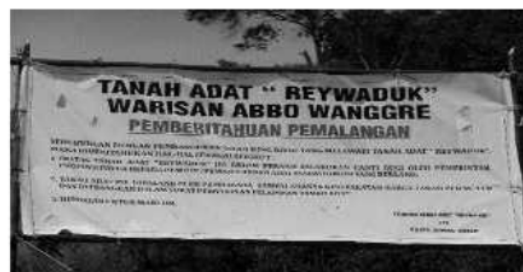
Figure 1. Illustrated information banners